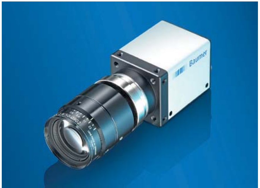
The TXG cameras from Baumer combines many technical features. Its ingenious temperature management, robust design and dust protection system permit long time stable measuring results in industrial surroundings. A wide variety of accessories such as Power over Ethernet (PoE) or Multi I/O guarantee nearly unlimited types of applications.

The ISW GmbH specializes in developing user-specific solutions in the field of image processing for measuring tasks, position recognition, quality assurance and the evaluation of data matrix codes. Bolstered by a record of more than 5,000 successfully installed systems worldwide, the company defines innovation-boosting solutions which are oriented towards the market and the individual user for a great variety of sectors and fields such as automotive and food, beverage, packaging, electronics and pharmaceutical industries as well as aviation. "Our customer is a plant manufacturer who wants to offer his textile industry client an up-to-date and much more time-saving inspection system to check spinning-plate capillaries than available until now" states Stefan Tukac, project engineer at ISW. Spinning-plate capillaries are drill holes with a diameter of only 0.35 millimeters which are located on the outer tracks of nozzle plates. The 800 millimeter wide, circular plates are used as tools in manufacturing basic materials for textiles. For this purpose, plastic polymers obtained from recycled PET bottles are pressed through the capillaries under very high pressure. This produces up to 46,000 individual threads, which are then interwoven into a tow. In various further process steps, these tows are refined into a textile substitute resembling cotton that forms the basis of many high-tech textiles.